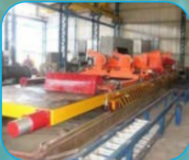
Ultrasonic Test Trolley