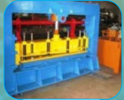
Hydraulic Shear Machine