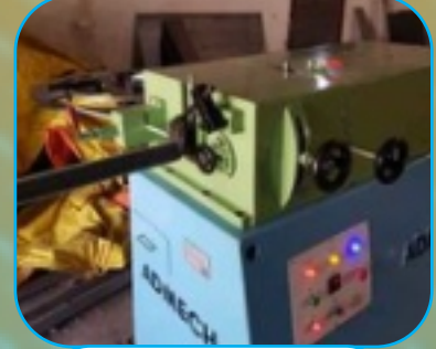
Tube Finning Machine