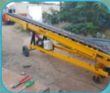
Hydraulic Bag Stacker