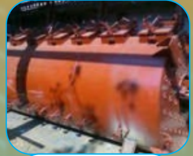
Cylindrical Pressure Vessel