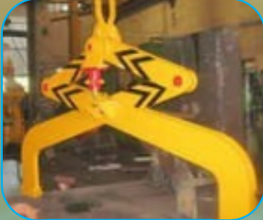
Solid Rod Lifting Tackle