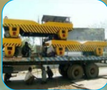
Coil Transfer Trolley