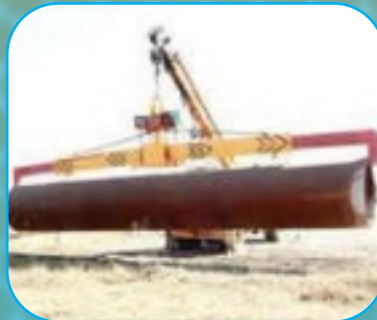
Pipe Lifting Tackle